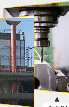
High Temperature Stove