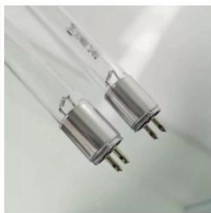
2 PIN G5 Head base Marched With G5 Socket

China Manufacturer UVC Sterilizer are used widely air disinfection system, water treatment system, painting industry, printing industry etc.