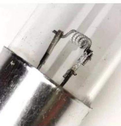
Max Starting Time ( 198V, 25°C): 20s Time to Reach 90% UV output: 300s