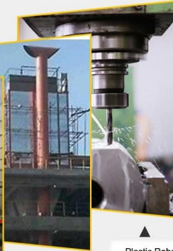
High Temperature Stove