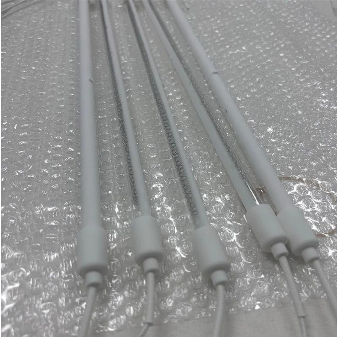
Fixture Each Lamp 2pcs