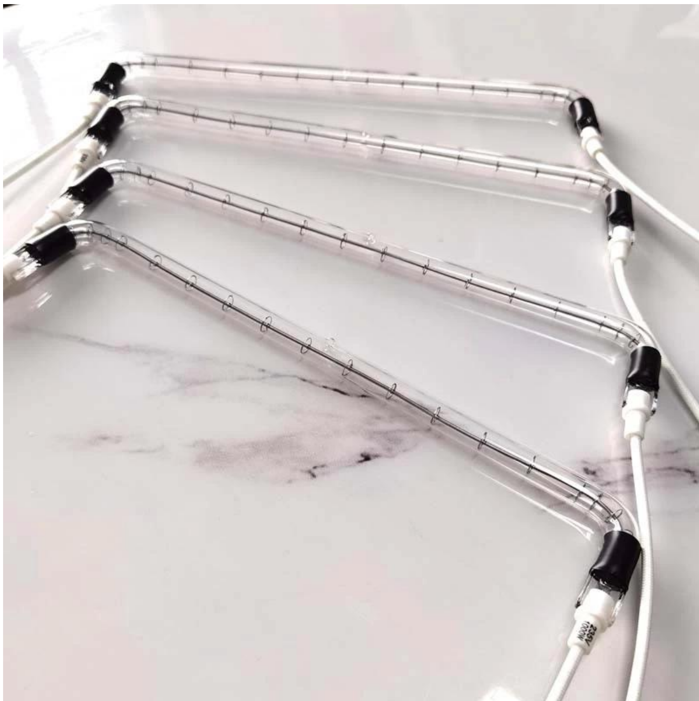
Fixture Each Lamp 2pcs